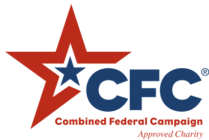
The approved charity logo.

This logo is available for charities that are eligible to be in the CFC. There should be no alteration of the words "Approved Charity" or additions to the mark.