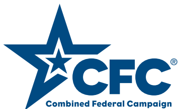
One-color Logo Option #1 (recommended)

In some instances, the two-color CFC logo cannot be used (e.g. to lower costs, black and white placements, etc.). When this occurs, use one of the one-color logos below. Whenever possible, use the recommended blue one-color logo.