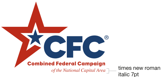
An example of a region logo.