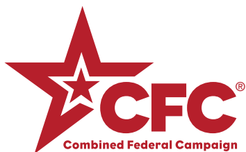
One-color Logo Option #2