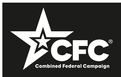
One-color Logo Knocked-out Option #3