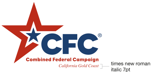
An example of a State logo.

The logos below show the correct font usage when adding state or region names to the main CFC logo. Right justification is used when adding state or region names.