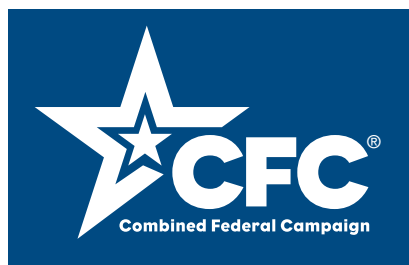
One-color Logo Knocked-out Option #1