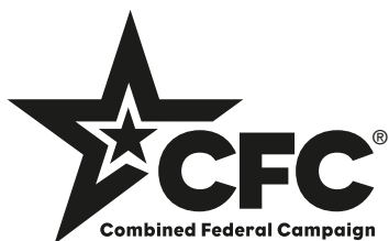
One-color Logo Option #3