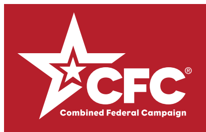
One-color Logo Knocked-out Option #2